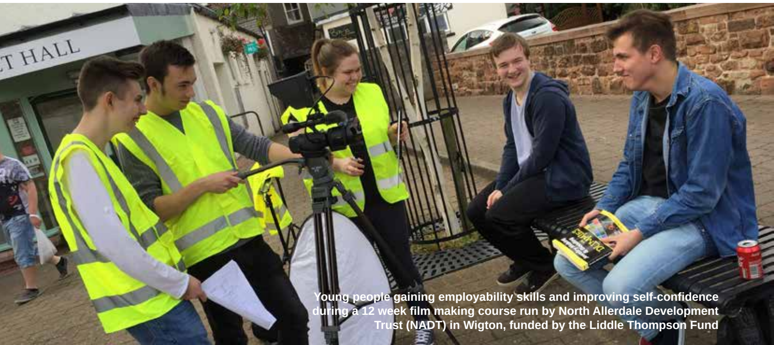
Young people gaining employability skills and improving self-confidence during a 12 week film making course run by North Allerdale Development Trust (NADT) in Wigton, funded by the Liddle Thompson Fund