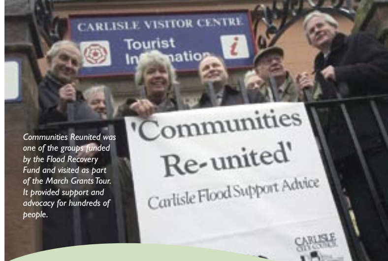
Communities Reunited was one of the groups funded by the Flood Recovery Fund and visited as part of the March Grants Tour. It provided support and advocacy for hundreds of people.