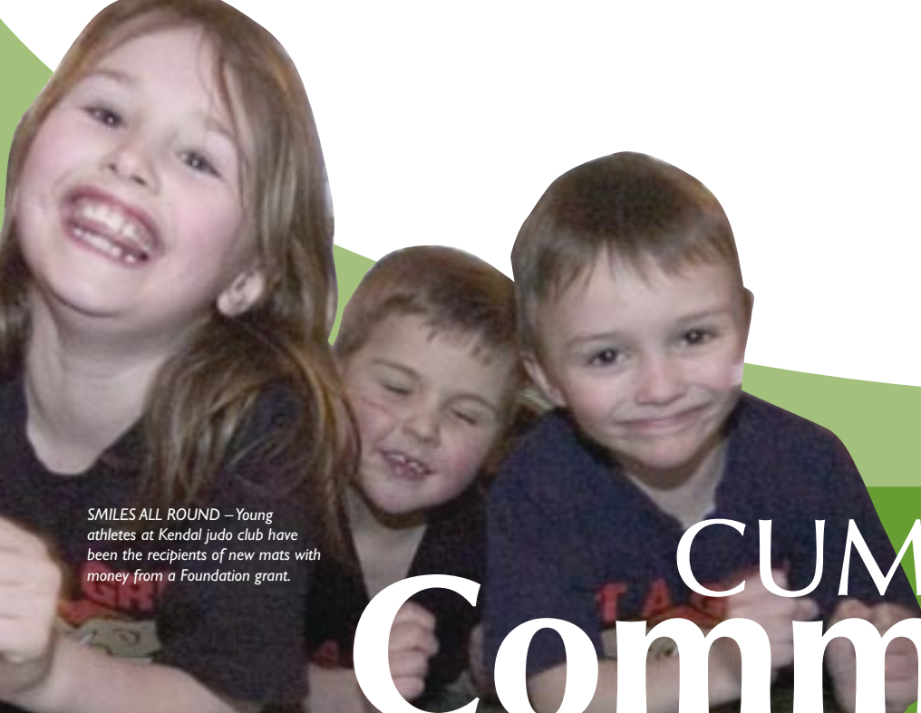
SMILES ALL ROUND – Young athletes at Kendal judo club have been the recipients of new mats with money from a Foundation grant.