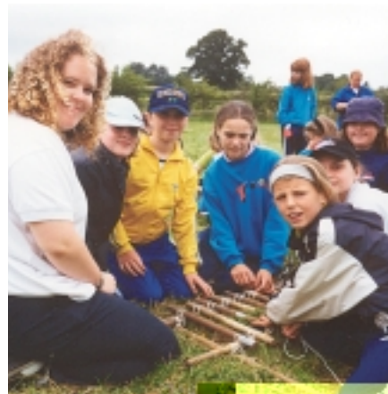
Carlisle Guide Camp - recipients of a Community Foundation grant

"The key focus is to build our long term funds by raising the Foundation's profile throughout Cumbria and increasing our