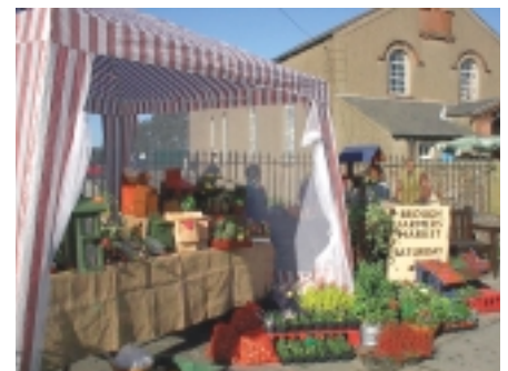
Brough Farmers' Market, one of the first grant recipients from our 'Strengthening Rural Communities' Fund

Examples of activities and groups funded in the first round include: Age Concern Eden Home Day Care Scheme, Cumbria Federation of Young Farmers' Clubs, Upper Eden Plusbus, 'Our Place' Ambleside Youth Project, South Lakeland Carers Association newsletter, Shap CDC Community Website development and volunteer training, Wigton Youth Station outreach work and Cumbria Rural CAB's Volunteer Development Worker.